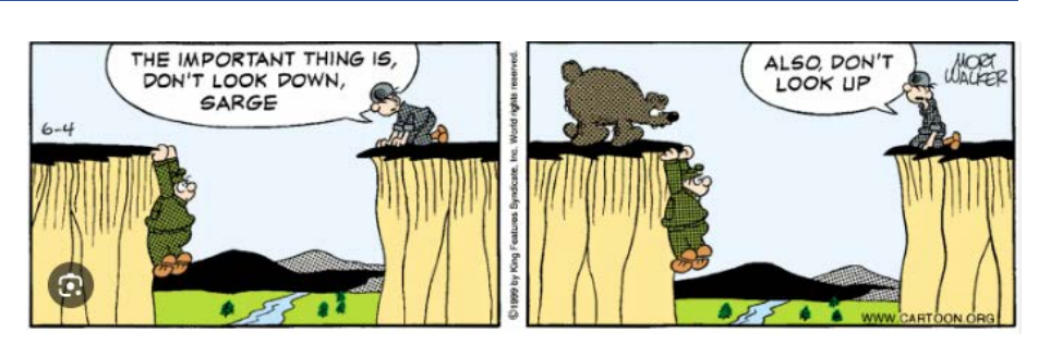
Beetle Baily by Mort Walker