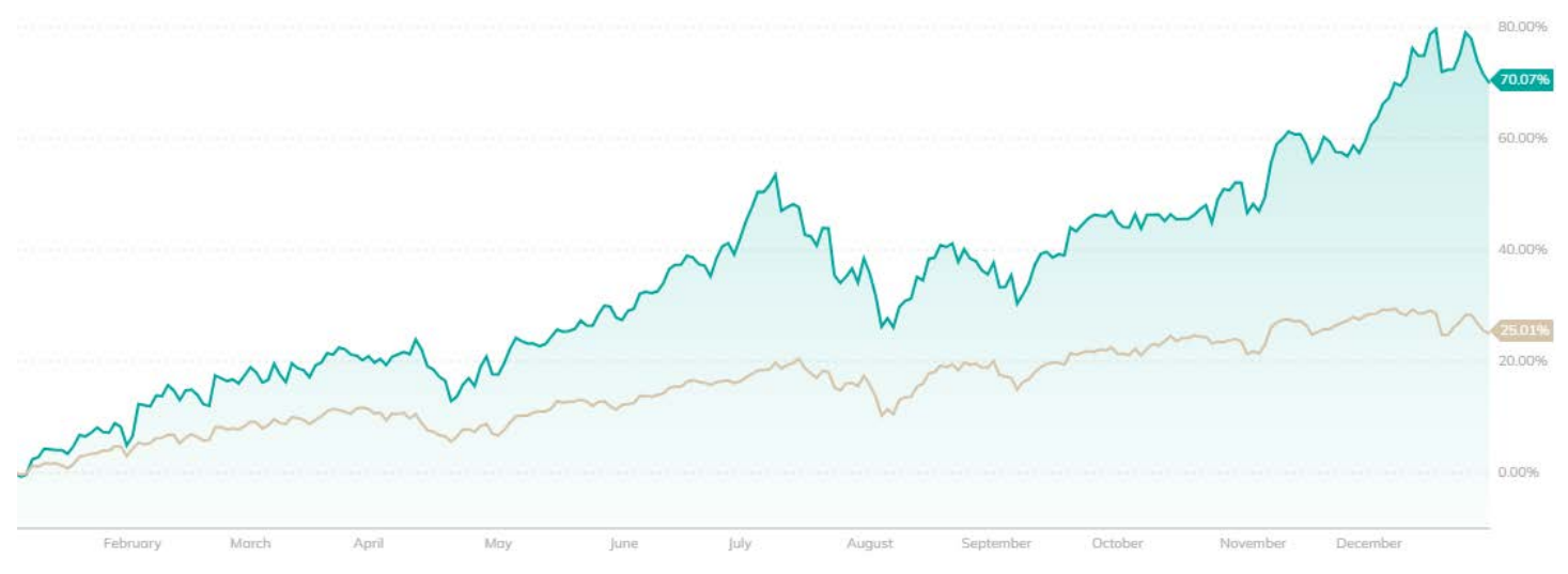
The Magnificent 7 vs. the S&P 500 Total Return 2024 Full Year (PortfoliosLab)

Equities were a tale of two markets. In one, the Magnificent 7 returned ~70% over the course of 2024. These top megacaps (Tesla, Amazon, Google, Apple, Meta, Microsoft and Nvidia) have outperformed in the bull market, lifted especially by Nvidia, whose earnings rose and got bought up by traders betting on further profitability from AI implementation. These 7 accounted for $16 trillion of the S&P 500's $46 trillion market cap. Overall, ~70% of stocks in the Index performed positively, and 10 had over 100% returns. On the flip side, 167 stocks (one third of the Index) performed negatively , 7 had returns around -50% or worse. Even amongst the strongest stocks by market cap, there were many losers. Dispersion has been especially high in the more cyclical Tech and Consumer Discretionary sectors. Equity valuations overall are stretched in the top decile of historical multiples (30x+ for the top winners). The non-Mag-7 S&P equities notched gains in typical growth-stock fashion, with multiples still ~20x. The equal weight S&P 500 has returned a much less impressive (but normal) ~10% over the year.